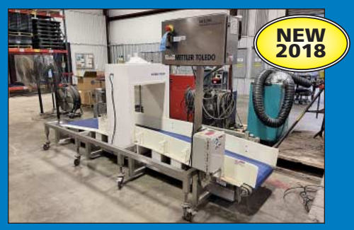
Toledo / Safeline Model SL2000 Conveyor Type Metal Detector