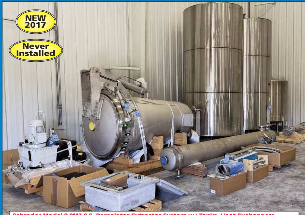
Schrader Model 2,0M3 S.S. Percolator Extractor System w/ Tanks, Heat Exchangers, Structure and Related

(2) 4,000-Gallon Steel Vertical Storage Tanks w/ Framework; 14' High x 8' Diameter, Bottom Discharge