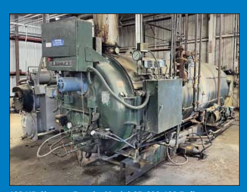
100 HP Cleaver Brooks Model CB-800-100 Boiler