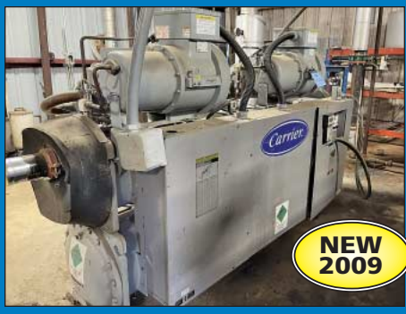
95 Ton Carrier Model 30HXC096R-661 Water Cooled Package Chiller