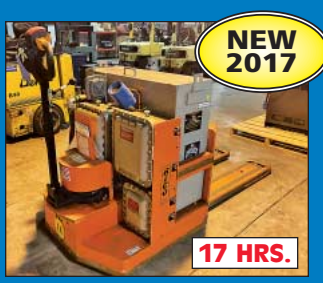
6,000 Lb. Rico Model PWH-EX-60 Electric Explosion Proof Walk- Behind Pallet Truck