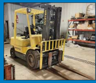
(2) 5,000 Lb. Hyster Model H50XM LP Gas Sold Pneumatic Tire Lift