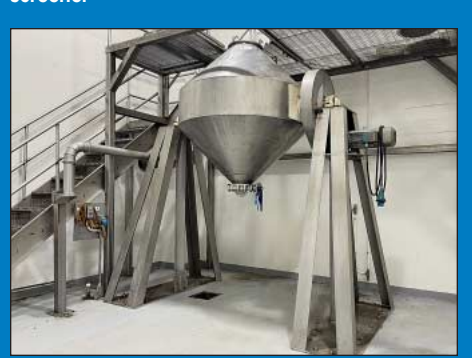
72" Wide x 72" High Single Wall S.S. Conical Blender