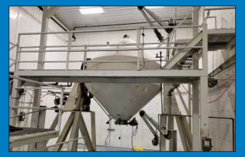
120" Wide x 120" High J.P. Devine Rotating Conical Blender w/ Jacketed, S.S. Interior