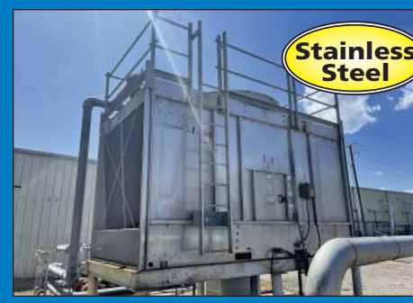
200 Ton Approx. Marley Model NC2211-S.S. Stainless Steel Single Fan Water Tower w/ Pumps

Shop Equipment Consisting of; (3) Tape Shooters, (2) Portable Steps, (3) Pedestal Fans, (2) Flame Cabinets, (3) Dump Hoppers, (3) Hydraulic Pallet Trucks, Forklift Lift Gantry Cage, (5) Expandable Conveyor Units, (2) 500 Lb. Scissor Lift Tables, (2) 60' Aluminum Brow Plates