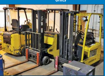
Electric Forklifts by Hyster, Yale and Others